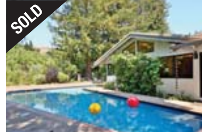
DUDUM REAL ESTATE GROUP 925.284.1400