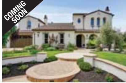
ZOCCHI & ASSOCIATES 925.360.8662